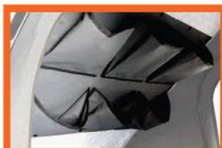
Internal storage bags

Stalk (reading) lights, USB charge point, cigarette point & power lead Internal storage bags for smalls like books & shoes For loading onto the tent's roof (50 kg max)