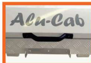
Tent roof handle